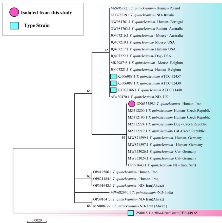
Figure 3. Phylogenetic tree of 30 representative Trichophyton quinckeanum based on the analysis of the internal transcribed spacer region sequences constructed using the neighbor-joining method.

Moreover, the MIC was obtained for butenafine (0.125 µg/ml), voriconazole (0.125 µg/ml), amphotericin B (0.125 µg/ml), econazole (0.5 µg/ml), griseofulvin (2 µg/ml), clotrimazole (4 µg/ml), isavuconazole (4 µg/ml), ketoconazole (4 µg/ml), miconazole (8 µg/ml), and itraconazole (8 µg/ml).