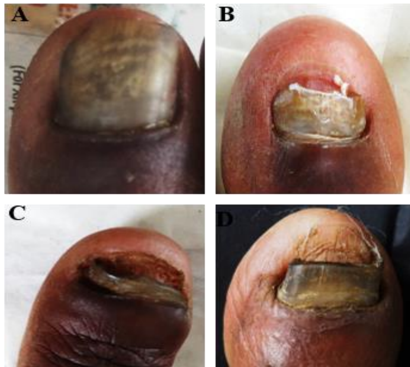
Figure 3. Clinical presentation of nails affected by pestalotioid fungi; a) Neopestalotiopsis piceana (DLSO), b) Pseudopestalotiopsis theae (DLSO), c) Pseudopestalotiopsis theae (TDO), and d) Pestalotiopsis species (DLSO) DLSO: Distal and lateral subungual onychomycosis, TDO: total dystrophic onychomycosis

DLSO (n=3), and TDO was detected in only one case (Figure 3).