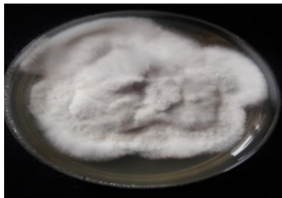
Figure 3. Colony of Scedosporium apiospermum complex on Sabouraud dextrose agar medium (The colony appearance is cottony and velvety, with the color being changed from white to grey.)