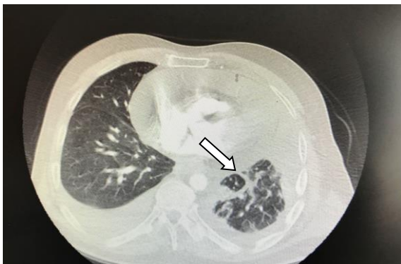
Figure 1. Presence of a mass lesion a year ago in the left lung lobe

Pleural fluid was cultured on two Sabouraud dextrose agar (SDA; Oxoid, England) media with cycloheximide and without cycloheximide slants and then incubated at 25^\circ\text{C} and 37^\circ\text{C} for 7 days. This led to the detection of rapidly growing fungal colonies. Initially, the colony appearance was cottony and velvety with the color being changed from white to grey (Figure 3). Septate hyaline hyphae were observed in the culture by microscopic examination with lactophenol. Conidia were observed to have an oval shape. They were placed onto conidiophore as small groups or solitarily (Figure 4).