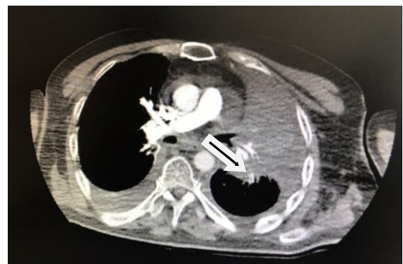
Figure 2. Presence of a mass lesion in the left lung lobe